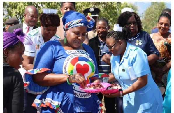
“Ndione kuti mukudya zotani” - Minister of Health feasts on the food she found prepared at the camp

Visit us at www.nonmmalawi.com Facebook & YouTube To join NONM contact Nelson Wasambo (Membership Intern) on 0882197763/ 0997244232)