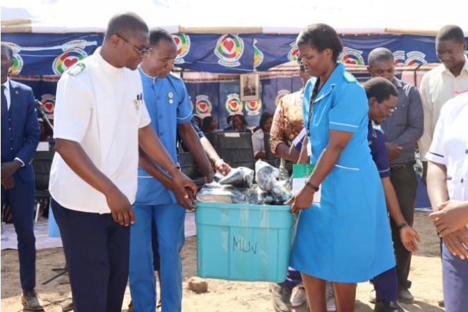
Special items such as shoes were also provided to nurses/midwives affected by the cyclone

On one side of the camp, outreach health services (mobile clinics) were in progress as the commemorations continued. Thus the people dwelling at the camp and nearby villages had an opportunity to access medical check-ups for cancer, BP, Diabetes, Sexually Transmitted Infections (STIs) and other services right at their doorstep. A crowning activity of the day was handing over food, clothes, masks and buckets worth millions of Kwachas to the brothers and sisters affected by cyclone Freddy. Their joy could not be hidden. The camp was Katuma, T/A Nogwe, the district Mulanje.