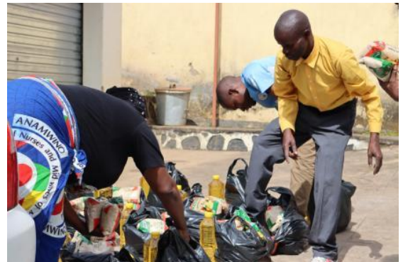
There's a lot of work that happened in the background to organise and sort items