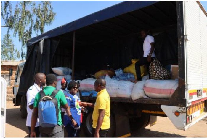
Off-loading relief items at the Camp