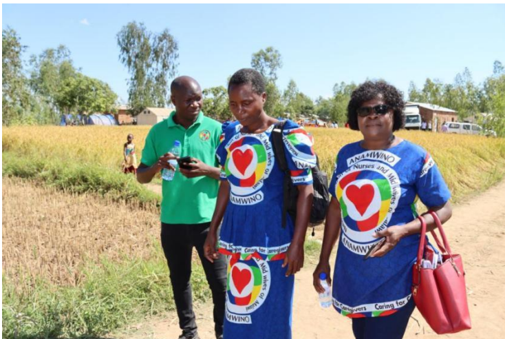
Moving about making sure everything is running smoothly; Accountant (left), North Zone Chairperson (centre), & Project Coordinator.