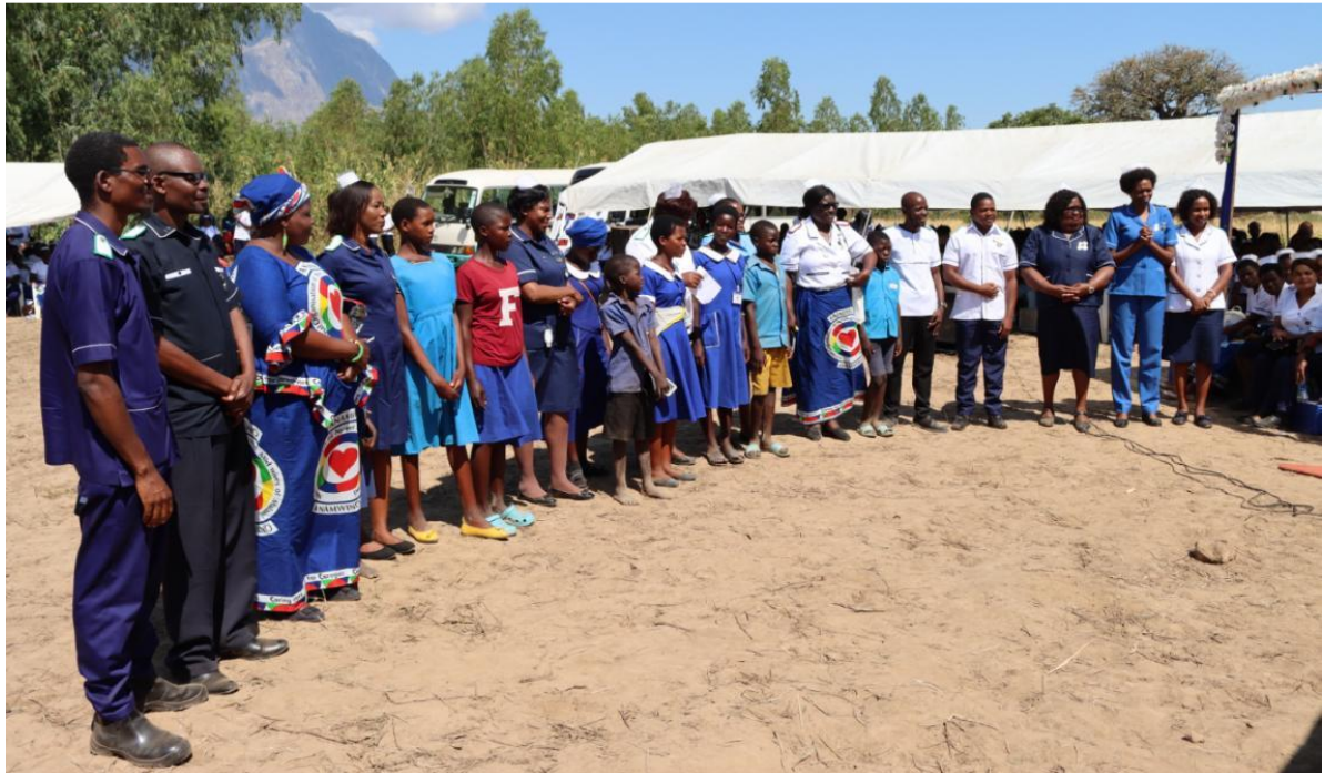
Primary school pupils were gifted money to help them purchase learning materials to encourage them study more and become nurses/midwives