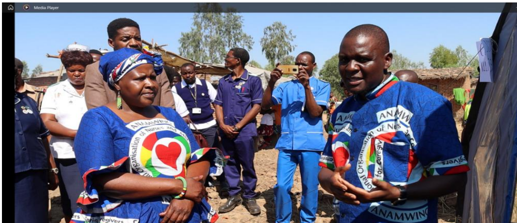
Central West Zone chairperson explaining to Chiponda about one of the mobile health clinics set up at the camp