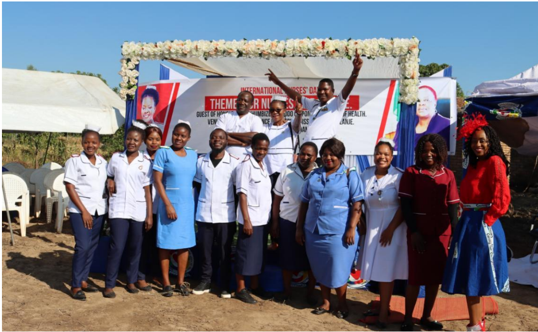
Nurses/Midwives pose for a photo before the official start of the event