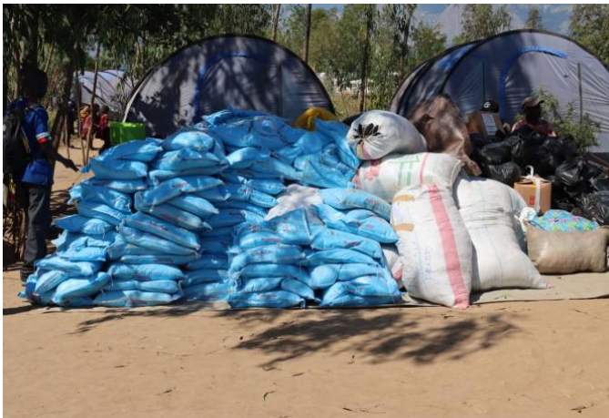
Food stuffs, Fabric, Masks, etc, offloaded.